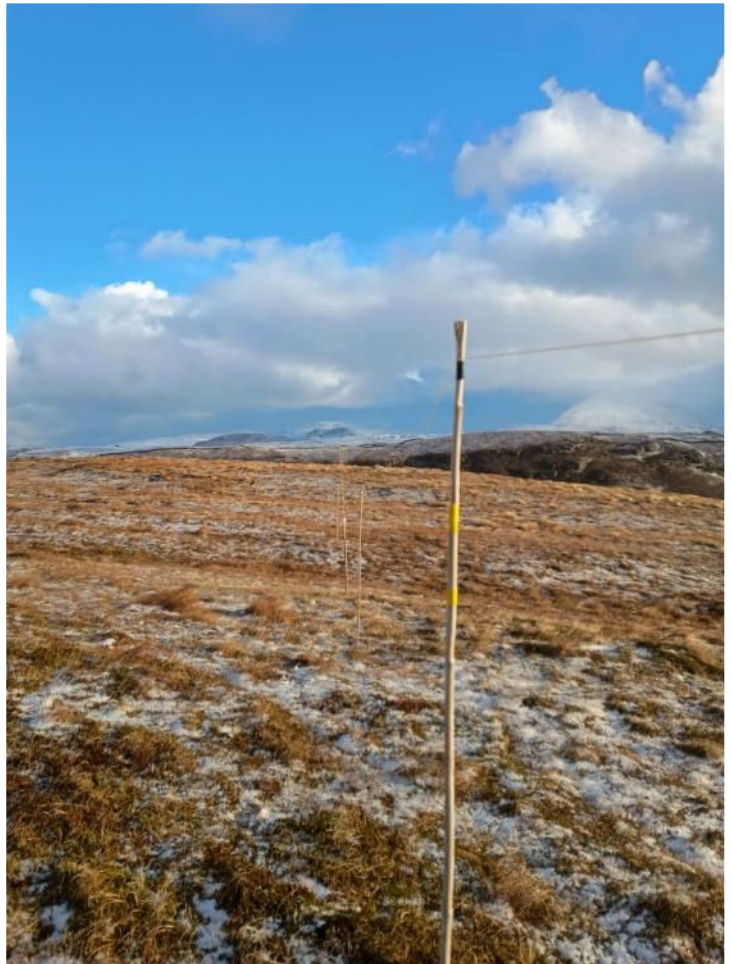
Above right: our 300° North American Beverage survives all weathers in its exposed hilltop run to the clifftops.

The weather during the rest of the fortnight was unseasonably mild at times and a long trek up the peat track from Sheigra to the north coast was possible in the second week. Though walking our long aerials each day also improves fitness! At the end of the fortnight, we took down our Beverages off the high ground a day early with a forecast of 80mph winds. We are used to strong winds up there, but the wind on the night of 27 th -28 th was something else! With rattling slates and roof timbers and big gusts shaking the cottage walls, sleep was very patchy. The cottage survived (as it has for decades!) but the remaining Beverage and EWE did suffer some damage in the hurricane which slowly eased the next day when we took them down.