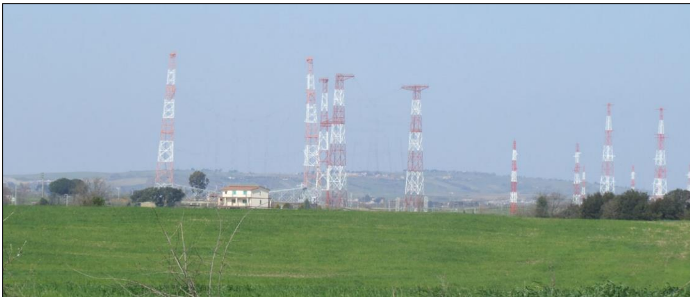
Santa Maria di Galeria

Note: USAGM broadcasts on shortwave (i.e. VOA) were discontinued following President Donald Trump's decision on 15 March 2025 to reduce the USAGM. This brings to an end USAGM relays via Santa Maria di Galeria.